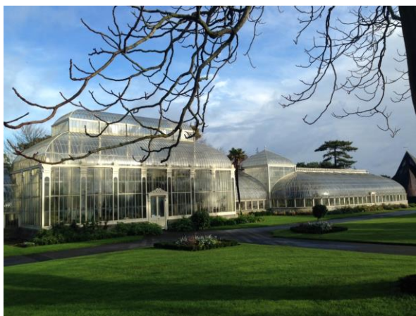
It is easy to get out into the green: clifftop walk in Howth; Dublin Botanic Gardens

All in all, I thoroughly enjoyed my two active tourist days before sitting down for three days of work, and I wholeheartedly recommend the IPA House in Dublin for you to use as a base.